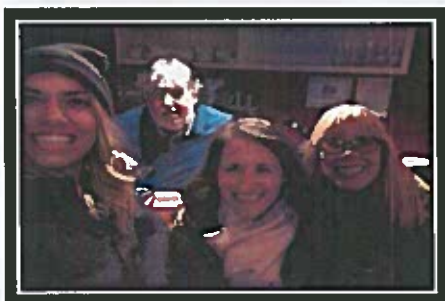
Group in Petronella's, Kilkenny, for SUBTITLE

SUBTITLE, supported by Kilkenny County Council took place from 20 th to 26 th November and once again portrays Kilkenny in a positive light. This year we agreed to some extra signage attached to street furniture and the response to date has been positive.