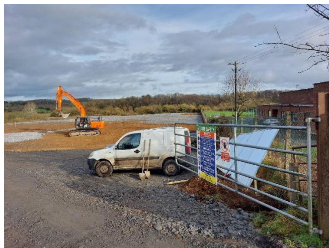
Works at Troyswood

Works are continuing on the upgrade of Troyswood water treatment plant. The upgrading and increase in capacity at the treatment plant at Troyswood will equip the plant to become the primary water treatment plant facility for Kilkenny City.