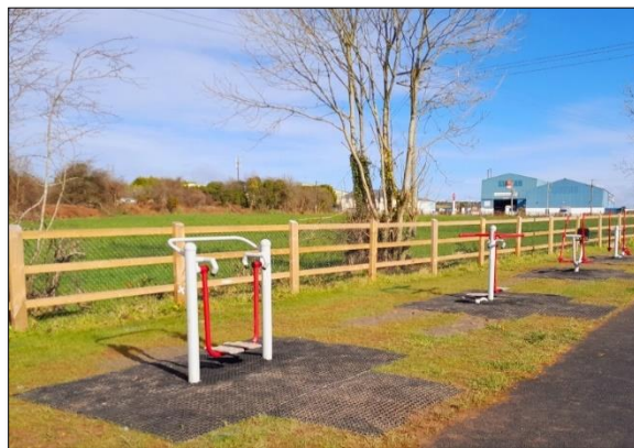
Recently installed outdoor gym equipment & outdoor activity trail at Slieverue Linear Park

provision of a basketball area were recently for pricing.