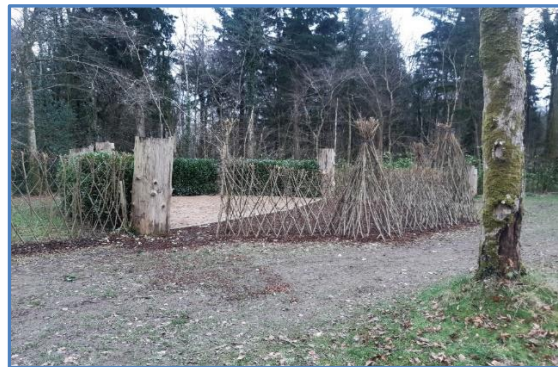
Pruning of willow tunnels around the sand pit in the playground at Woodstock

Work also too place in the natural play area where the willow tunnels which offer a fun natural element to the play area were pruned back. Further elements will be added to this play area this year with funding available for a sensory play area and accessible playground equipment from the Disability Participation and Awareness Fund.