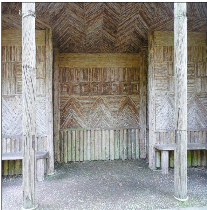
Knox's Bower Summer House

The upgrade of the herbaceous border is scheduled to take place after the Easter holidays. Knox's Bower Summer House has been repaired where bamboo was damaged on the decorative walls. All materials were sourced from the gardens and skilfully applied to this unusual garden folly.