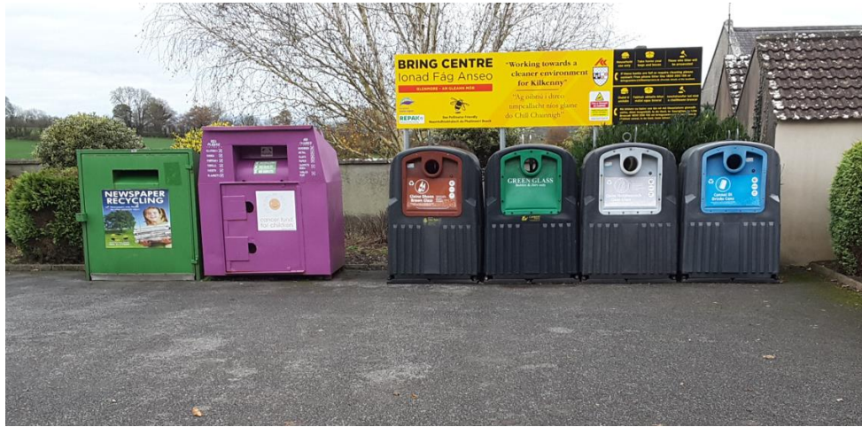
Photo of Bring Banks in Glenmore, Co. Kilkenny