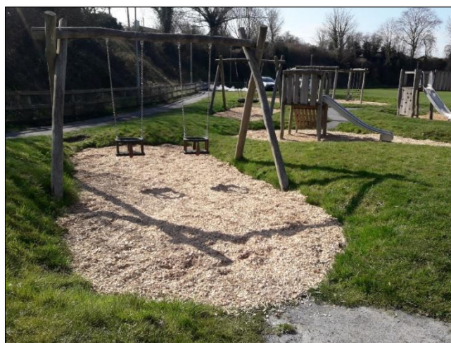
Goresbridge playground with newly laid impact absorbing surface

Elsewhere around the County on-going maintenance continues in our playgrounds. This involves the upgrade of the impact absorbing surface which is critical to the operation of playgrounds. Bark chip is commonly used and must be kept clean and to the desired depth at all times. Considerable effort goes into ensuring this is the case with weekly checks and cleaning.